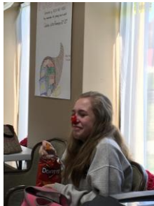
High School & 8 th Grade Lunch..