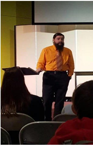
Chess Club Meeting!