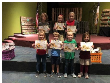
Step Out Award Winners!