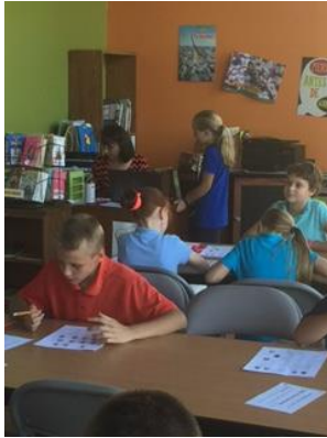
4 th Grade Spanish