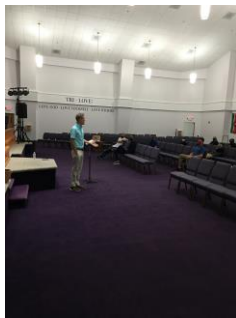
Middle/High School Chapel...