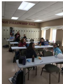
7 th Grade Enjoying Lunch