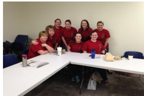
Preschool -Classroom Management Training!