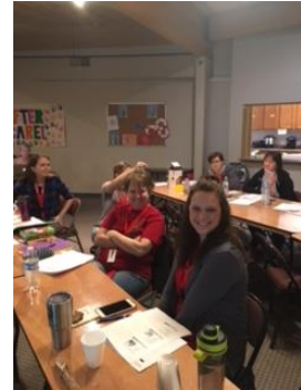
Preschool Staff attending "STEM" training to improve their ability to care for our little people!