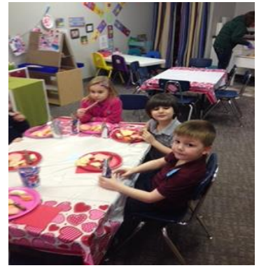
Moore/Peters- Preschool Class Valentines Party!