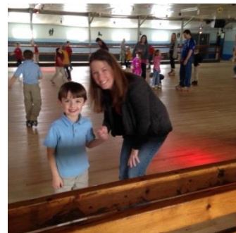
Kindergarten Valentines Skating Party!