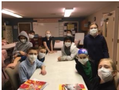
5 th Grade practicing communicable disease prevention!