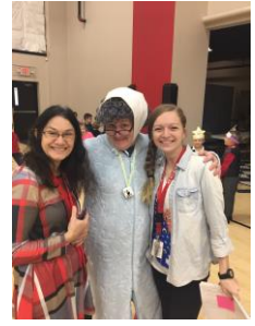
100 th Day of School Celebration...