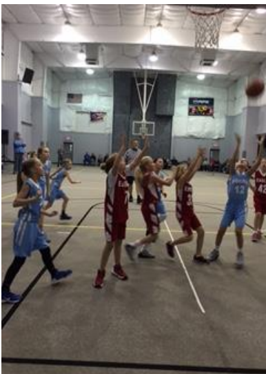
Girls Basketball vs. Adena!

Sports- Final games tonight for our 3 rd -4 th grade and 5 th -6 th grade boys' basketball teams starting at 5:30 here at B.S. vs. Southeastern. The Jr. High boys will play their last game on Mon. Feb. 15 th here at B.S. at 6:30 vs. Hillsboro Christian. Please come out and support our teams!