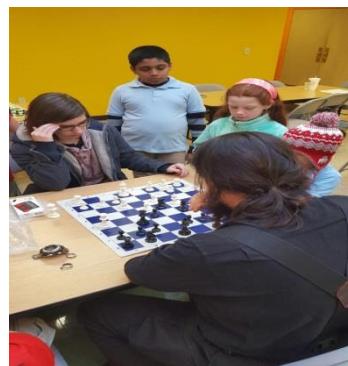
Coach vs. student