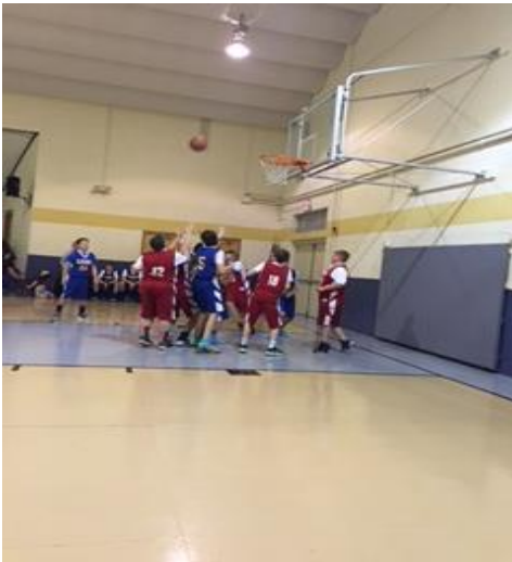
Jr. High Boys vs. Pike Christian