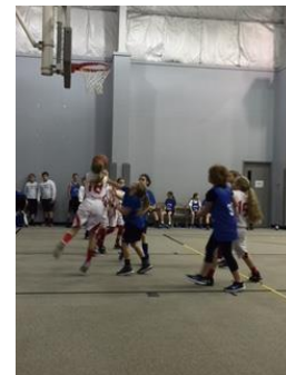
Jr High Girls