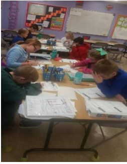
4 th Grade